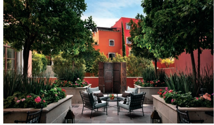
They feature 2, 4 and 5 bedrooms, marble bathrooms and walk-in closets, ample living areas, patios, garden, kitchen with Viking® equipment, elevator (except for the 2 bedroom ones), private underground parking and terrace on the top floor with a barbecue, fireplace, jacuzzi and spectacular views of the town centre.

Each property has between 420 and 750 square meters in area.